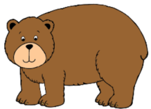
Bears Class Not started full time