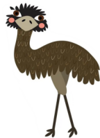
Emus Class Not started full time