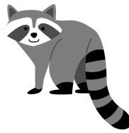
Raccoons Class 96.71%