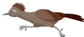
Roadrunners Class 96.93%