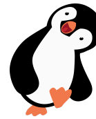
Penguins Class 90.98%