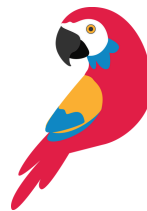
Macaws Class 95.19%