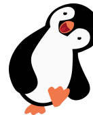
Penguins Class 87.98%