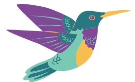
Hummingbirds Class 95.20%