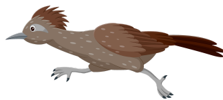
Roadrunners Class 95.1%