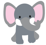
Elephants Class 96%