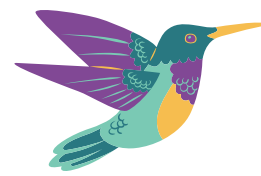
Hummingbirds Class 96.3%