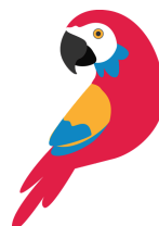
Macaws Class 95.3%