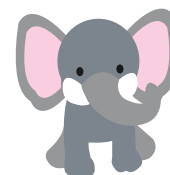
Elephants Class 95%