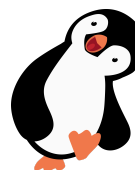
Penguins Class 90.9%