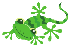
Geckos Class 96.7%