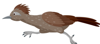
Roadrunners Class 98.3%