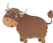
Yaks Class 90.87%