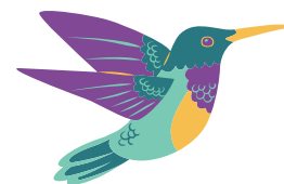
Hummingbirds Class 95.26%