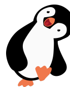
Penguins Class 92.13%