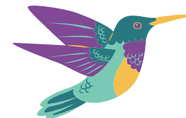
Hummingbirds Class 96.32%